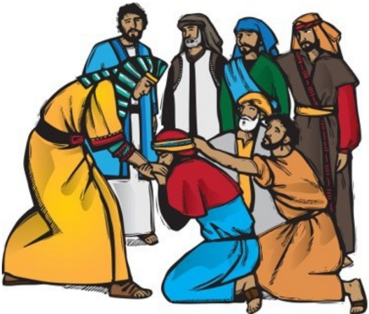
Joseph Forgives His Brothers